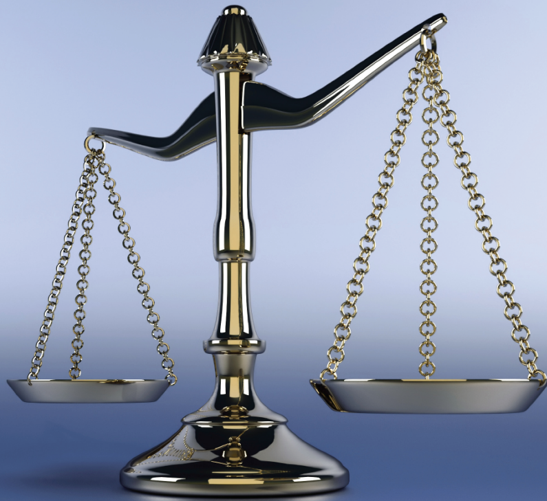
Table 8 Litigation Solutions is a Worldwide Network of professional court reporters, videographers and trial support companies independently owned with high standards that will treat you as if you were one of their own clients.

No more numerous calls and the hassle of scheduling. Just one phone call to Table 8 Litigation Solutions will save your office time and money locating an experienced court reporter, videographer, conference room or scheduling a videoconference in any city, any day, any time.